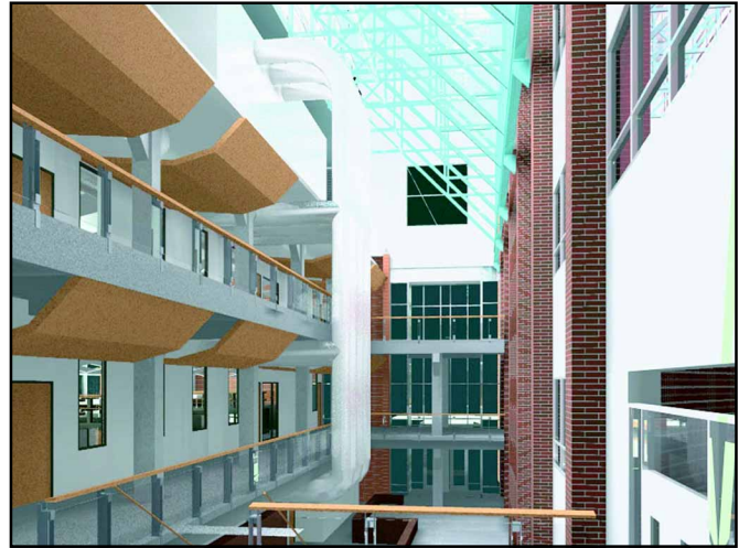
Figure 3: Low cost, low-pressure drop laboratory supply ducting integrated with atrium space. 2